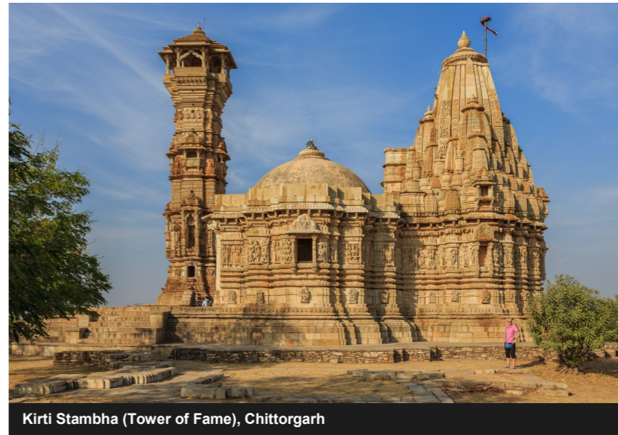
Kirti Stambha (Tower of Fame), Chittorgarh

Shiva embodies creation and new beginnings as well as preservation and destruction. Together with Shiva, the bull Nandi as his mount, his wife Parvati and his sons Skanda and Ganesha are often depicted.