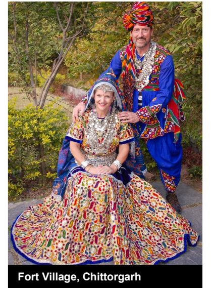
Fort Village, Chittorgarh

The most famous temples of Rajasthan are the Brahma Temple in Pushkar, the Dilwara Jain Temple of Mount Abu, the Eklingji Temple in Udaipur, the Jain Temples of Ranakpur, the Karni Mata Temple in Deshnok (Bikaner) and the Shrinathji-dwara.