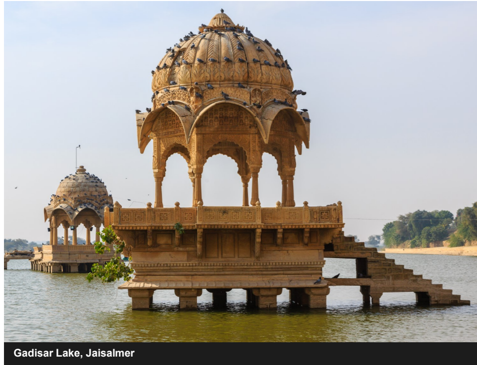
Gadsisar Lake, Jaisalmer