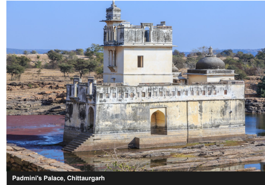
Padmini's Palace, Chittaurgarh