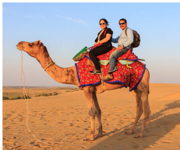
Camel ride, Kanoi

Kuldhara is a famous village that was abandoned by all its inhabitants in just one night. About 200 years ago, the Diwan came to the village to collect taxes. He fell in love with the beautiful daughter of the village chief (Mukhia) and wanted to marry her. However, Mukhia and villagers were against the marriage. Together they decided to flee and leave Kuldhara and 84 other villages.