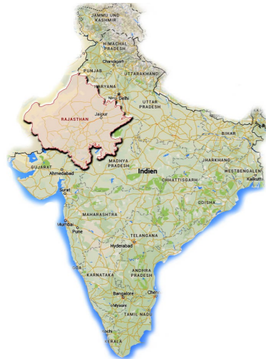
Rajasthan: India's largest state

Magnificent palaces, majestic forts, colourful cities and barren desert landscapes