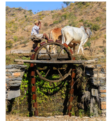
Traditional irrigation, Kamba

Many small farmers still depend on rotating oxen to irrigate their fields during the dry season. Using cogwheel technology and a chain to which vessels are attached, they fetch the water from the depths and pour it into irrigation channels.