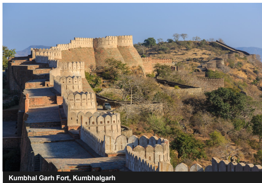
Kumbhal Garh Fort, Kumbhalgarh