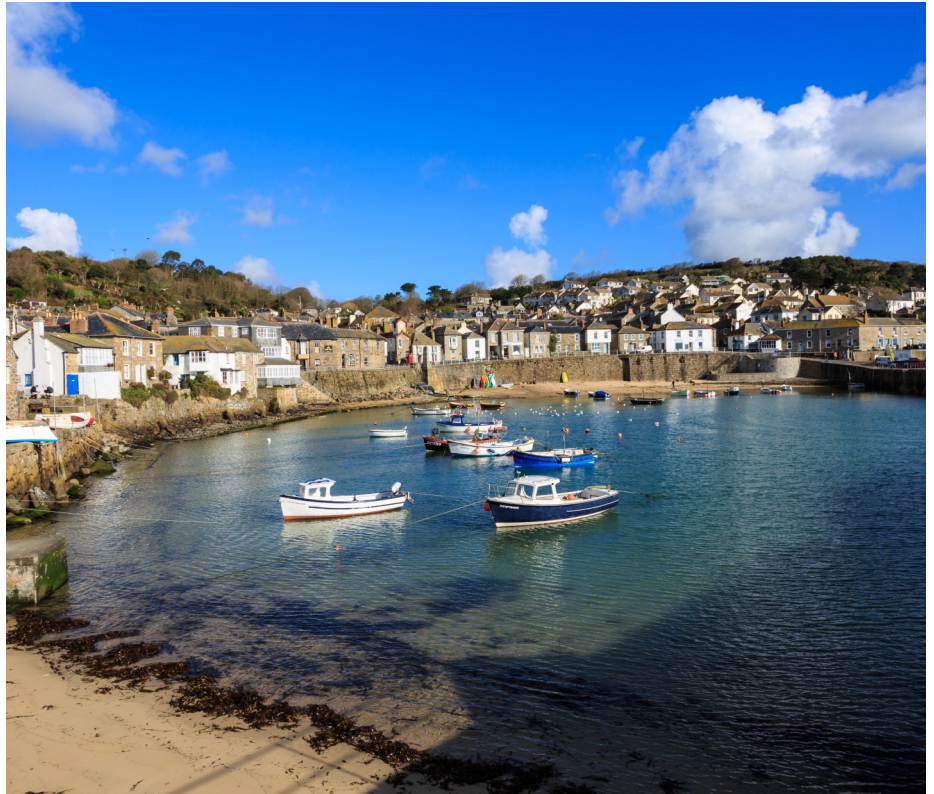
Mousehole Village and Harbour

Camilla Parker Bowles became Duchess of Cornwall in 2005 when she married Prince Charles. She is thus the second most important woman in the British monarchy in the ranking of the United Kingdom.