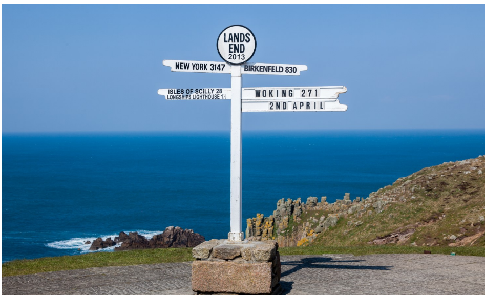
Most westerly point in England: Lands End, Cornwall