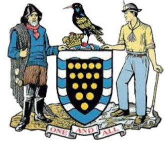
Wappen von Cornwall

Newlyn has the largest fishing harbour in England with more than 16 ha. However, like everywhere else, many fishermen in Newlyn had to give up their boats due to fishing quotas. Today, only a few still live from fishing.