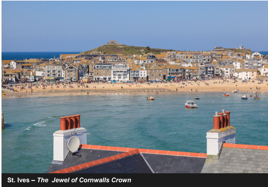
St. Ives – The Jewel of Cornwall's Crown