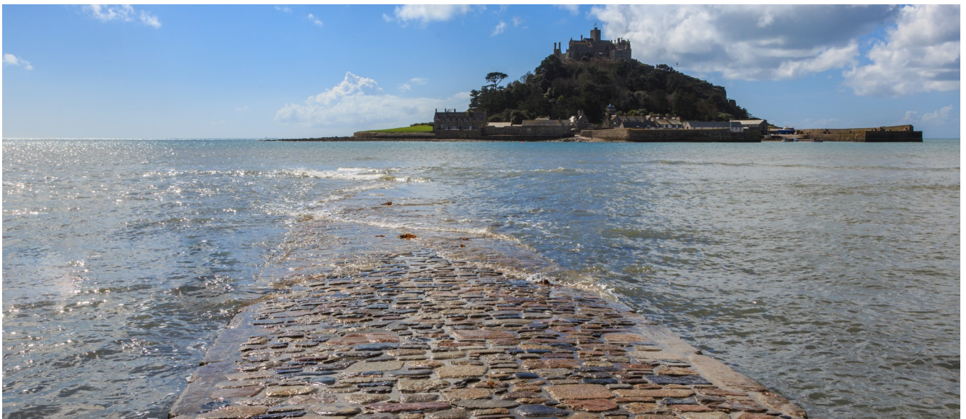
St. Michael's Mount Causeway

#1 Barbara Hepworth Museum and Sculpture Garden - St. Ives, #2 Penlee House Gallery & Museum - Penzance, #3 Telegraph Museum Porthcurno - Porthcurno, #4 The Museum of Witchcraft - Boscastle, #5 Charlestown Shipwreck & Heritage Centre - St. Austell, #6 National Maritime Museum Cornwall - Falmouth, #7 Cornwall Aviation Heritage Centre - Newquay, #8 Pirate's Quest - Newquay, #9 Mevagissey Museum - Mevagissey, #10 Davidstow Airfield & Cornwall At War Museum - Camelford.