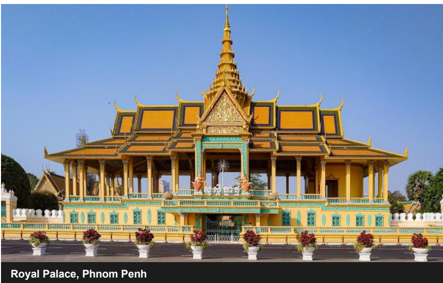
Royal Palace, Phnom Penh

The Royal Palace in Phnom Penh is a complex of buildings that serves as the residence of the King of Cambodia. The palace was built by King Norodom Sihanouk in