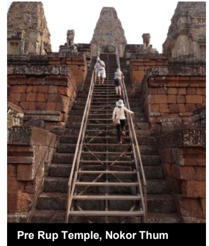
Pre Rup Temple, Nokor Thum

1866-1870 and is surrounded by an imposing wall. The palace cannot be visited because the king lives there. However, the throne room, the treasury and the outside areas are impressive enough and can be visited.