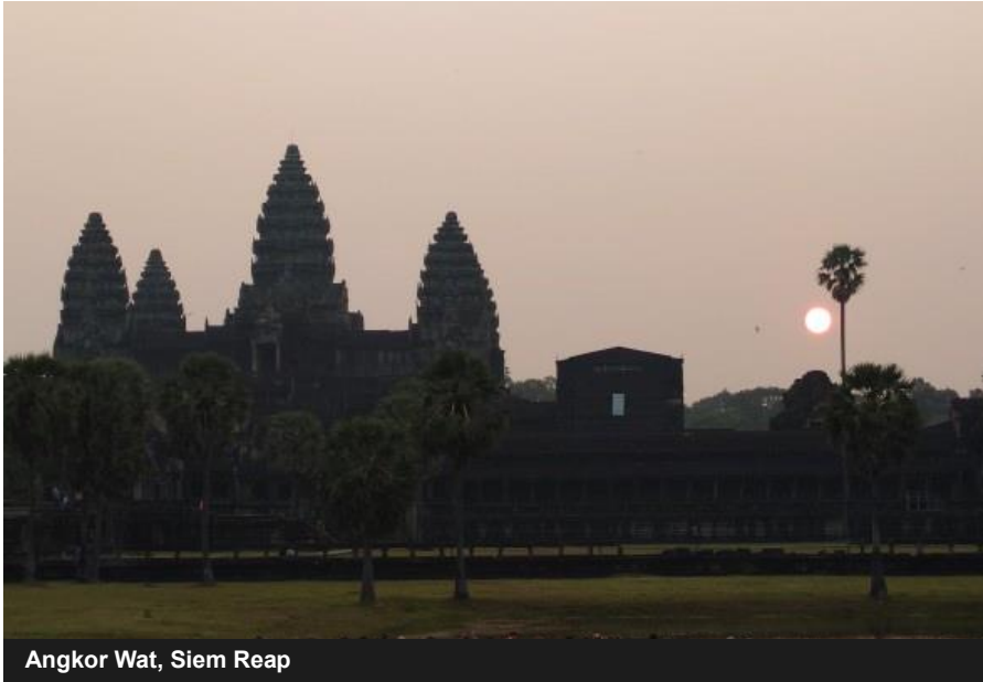
Angkor Wat, Siem Reap

Angkor Wat is one of the largest and most important temple complexes in the world, built in the 12th century by the Khmer kings in Cambodia. Angkor Wat means "City of Temples" and is a symbol of both Hinduism and Buddhism, which are prevalent in the region. Angkor Wat is famous for its architectural beauty, ornate reliefs and spiritual significance. Angkor Wat is a UNESCO World Heritage Site and a popular tourist attraction.