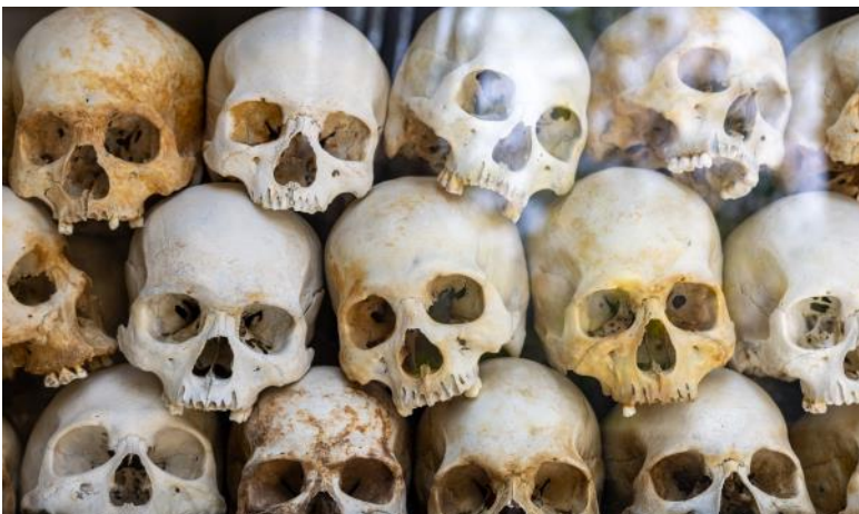
Genocidal Center, Choeng Ek

Cambodia is a country in Southeast Asia bordering Thailand, Laos and Vietnam. The country's history is marked by wars and conflicts, especially the genocide by the Khmer Rouge in the 1970s. The conviction of high-ranking representatives of the Khmer Rouge was a milestone in coming to terms with the genocide and made the history of the genocide known to a broad public. The population suffers from traumatising, political repression, land theft, corruption and a weak justice system.